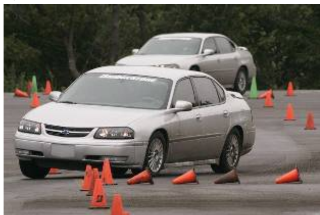
DRIVE: HERSCHE/PA/Press-association Images

Premium brands unsurprisingly have the best levels of standard AEB fitment. However, some volume sector manufacturers are making AEB systems available on cars such as the Mazda CX-5, the Ford Focus, the Honda Civic and the VW Up.